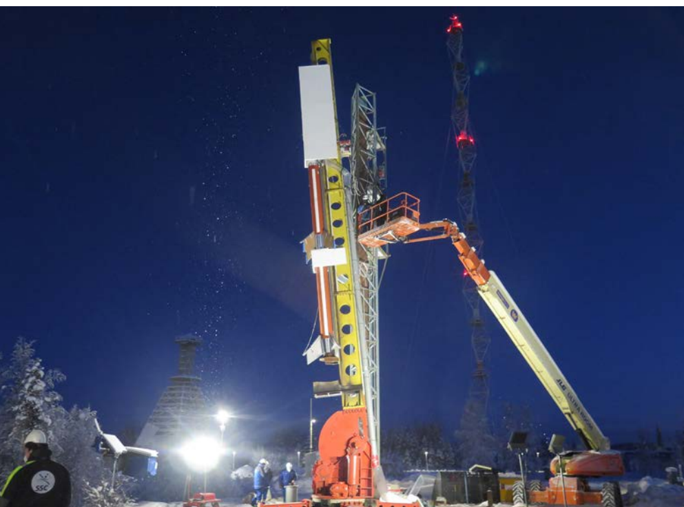
Preparation of MAPHEUS 10 launch from Esrange Space Center

In March, SSC launched a new space situational awareness (SSA) program. The goal is to contribute to safer and more sustainable space activities. The program consists of several initiatives such as tracking and identifying space objects created by humans, as well as processing, cataloging and analyzing SSA data. Through this programme, SSC contributes to the sustainable future use of space.